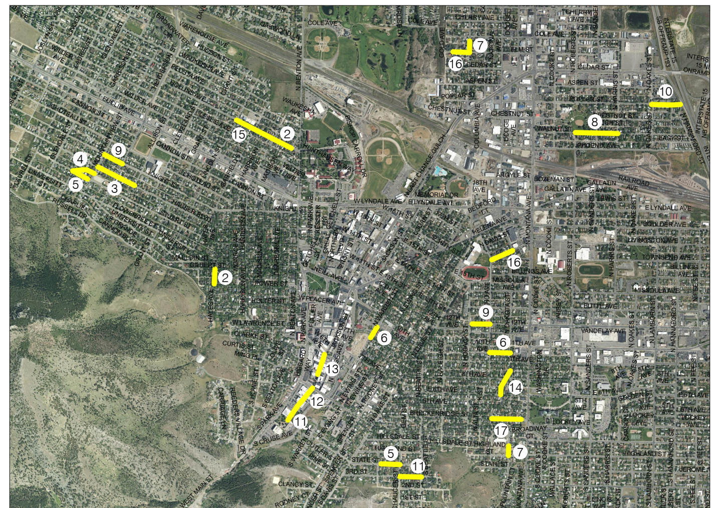
CITY OF HELENA VICINITY MAP / SHEET INDEX NOT TO SCALE