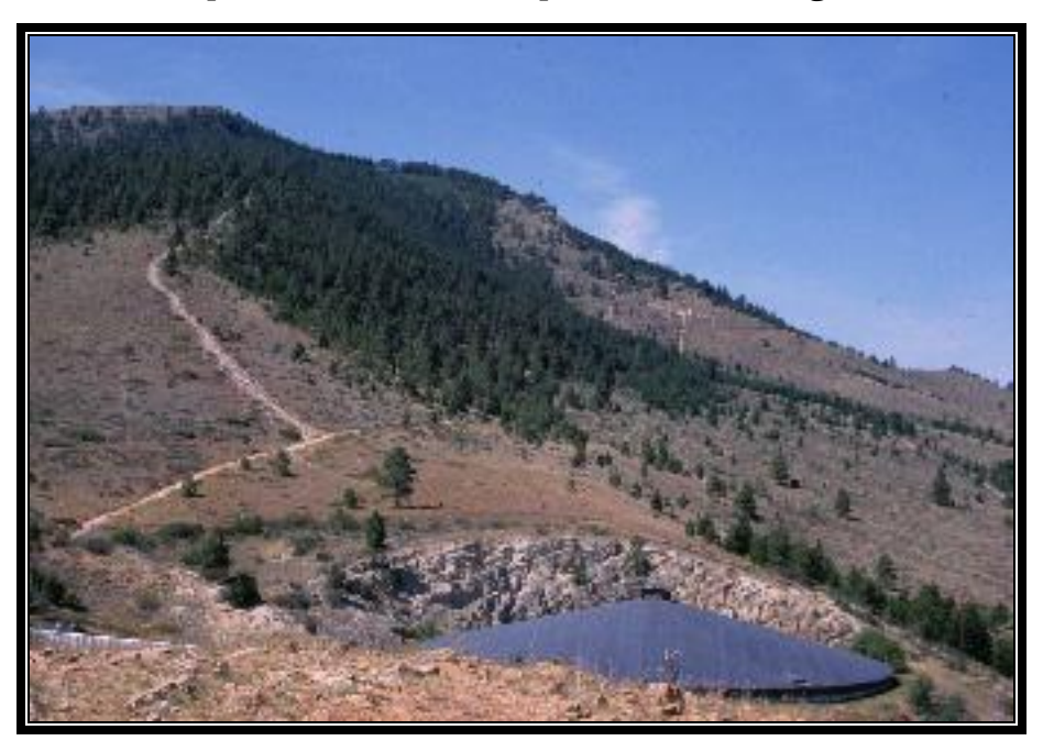
Prepared by the Prickly Pear Land Trust For the City of Helena Parks and Recreation Department and the Helena National Forest

A Sub-plan of the Helena Open Lands Management Plan