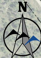
PLAN VIEW OF WEST SIDE SUBDIVISION