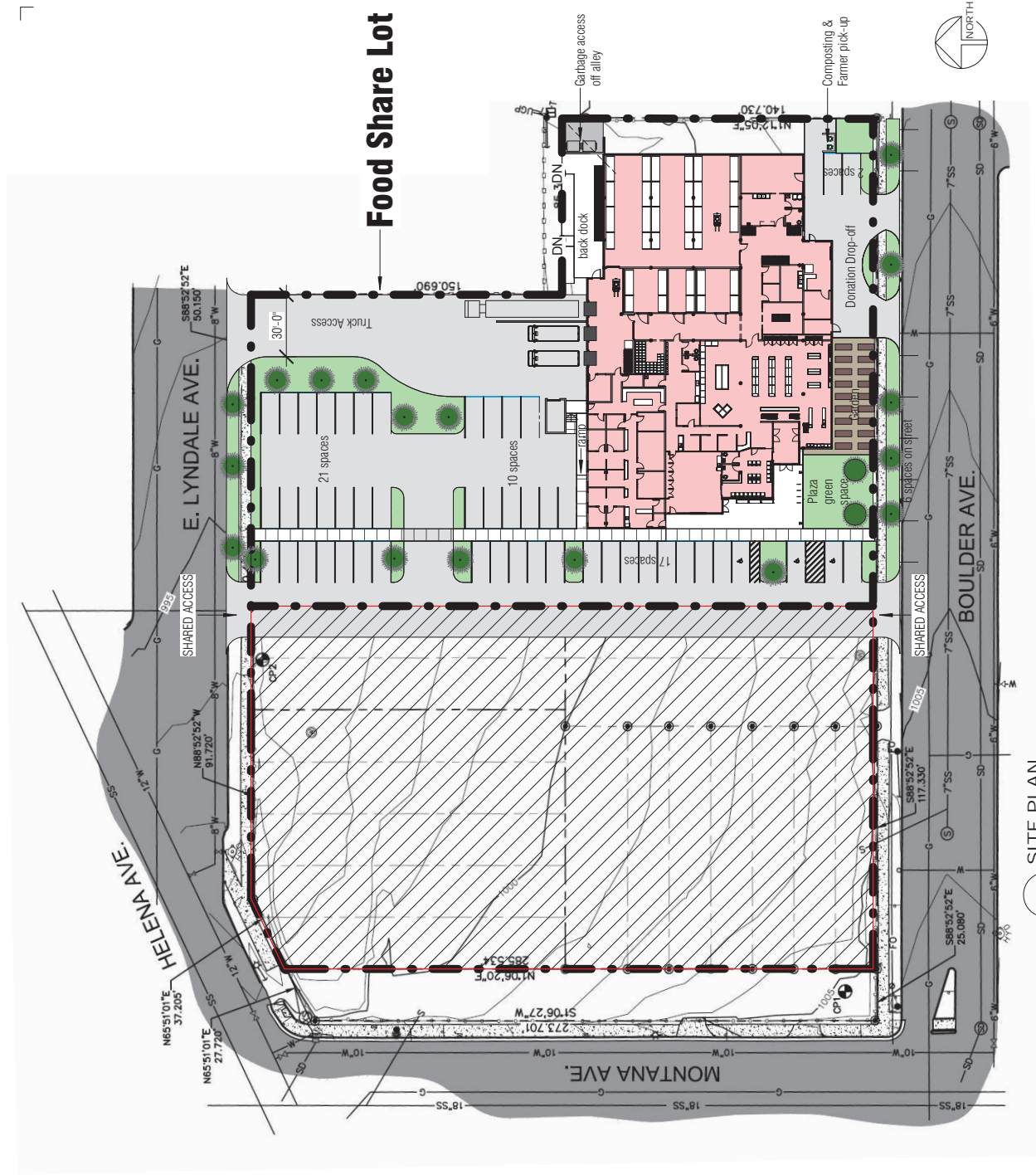
1 SITE PLAN 1" = 50'-0"