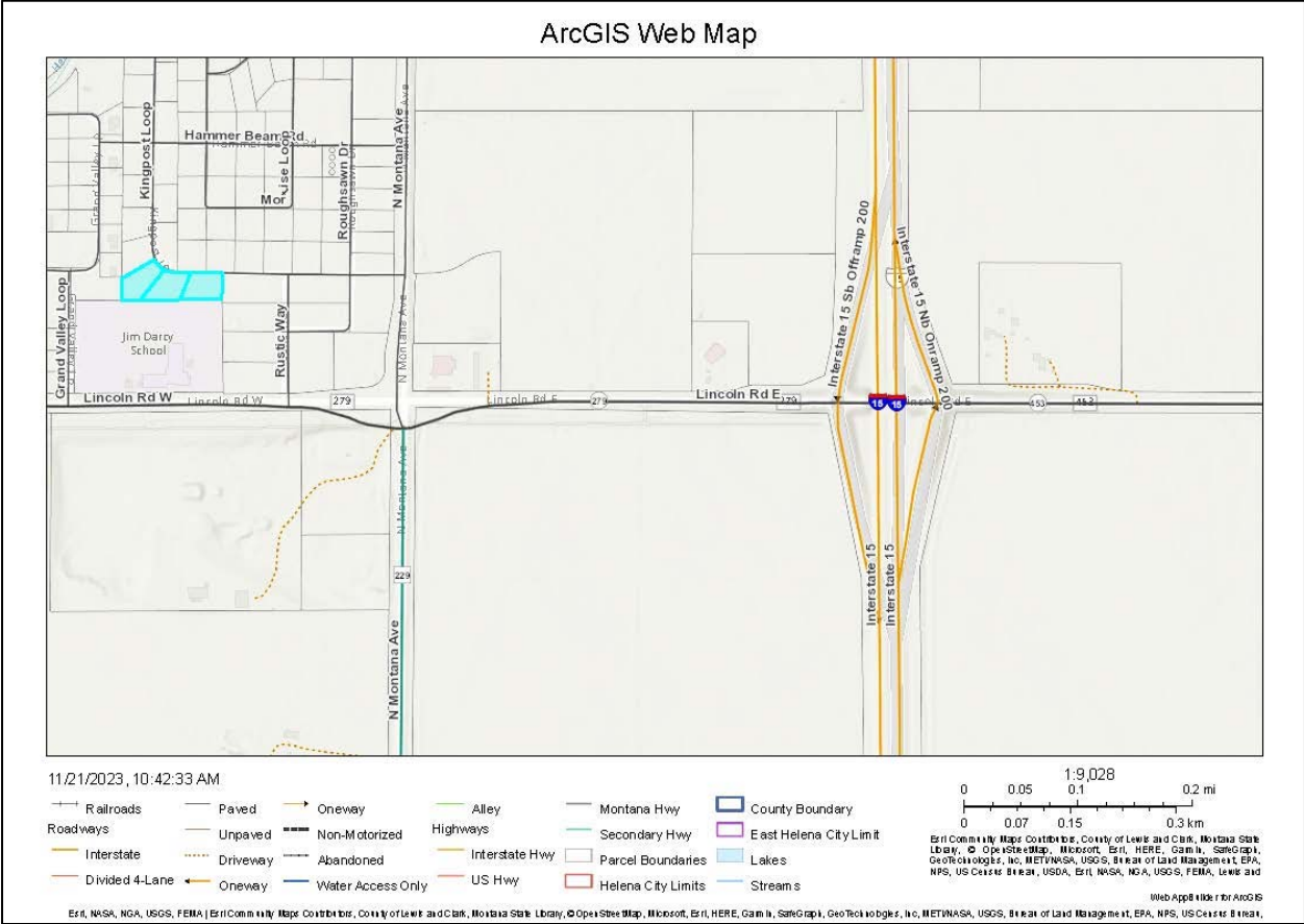
Exhibit A: Location Map of Timberworks Parkland