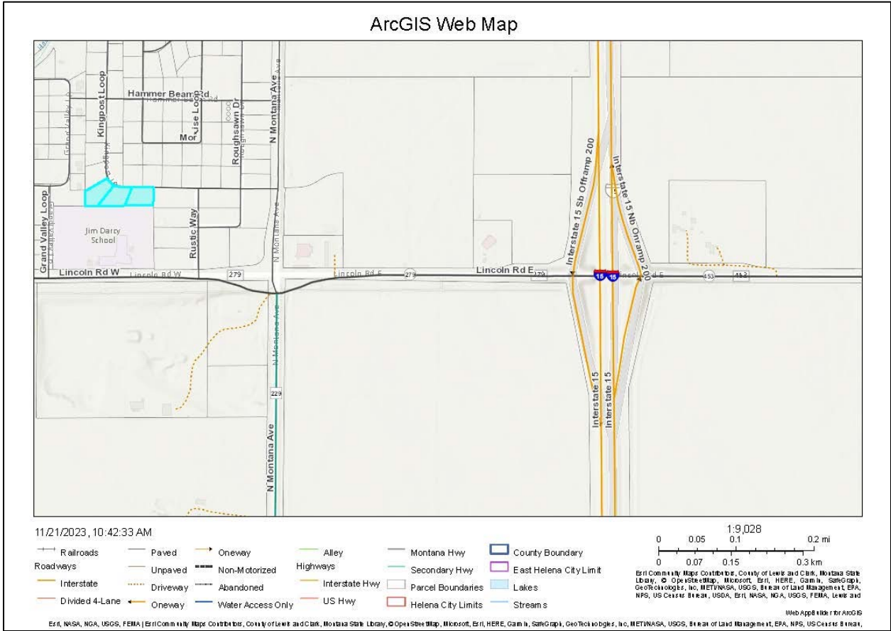
Exhibit A: Location Map of Timberworks Parkland