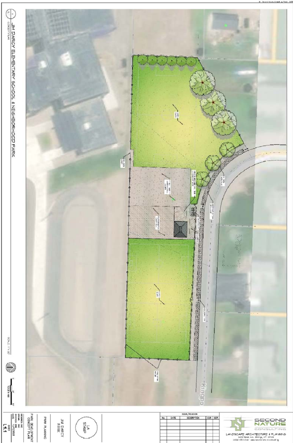
Exhibit B: Layout of Proposed Design