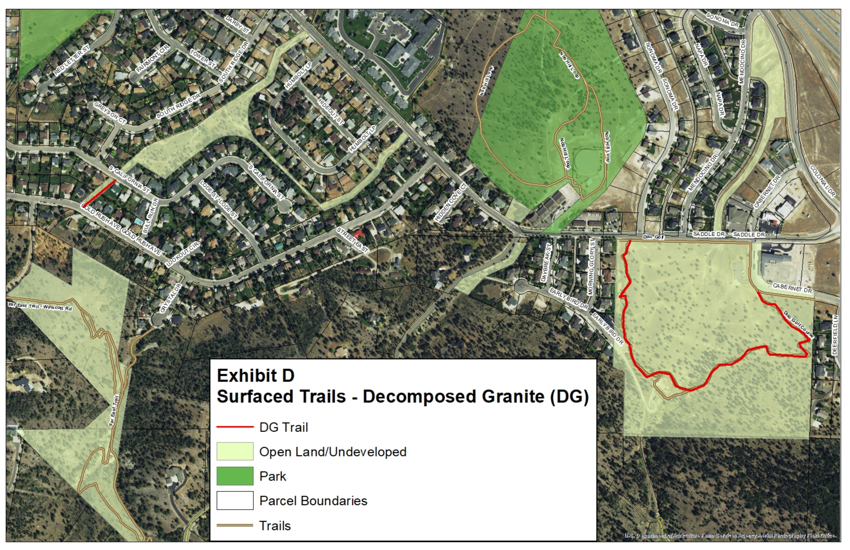
Exhibit D Surfaced Trails - Decomposed Granite (DG)