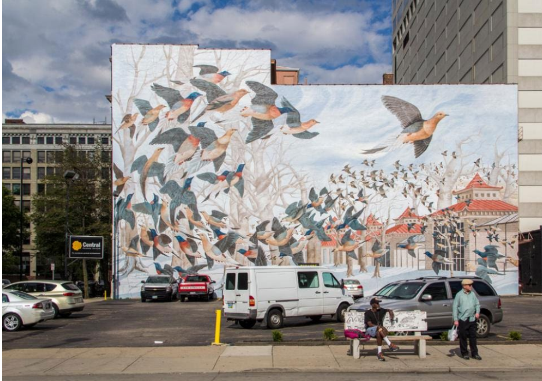
A mural in remembrance of the chinese culture that once flourished in the neighborhood...