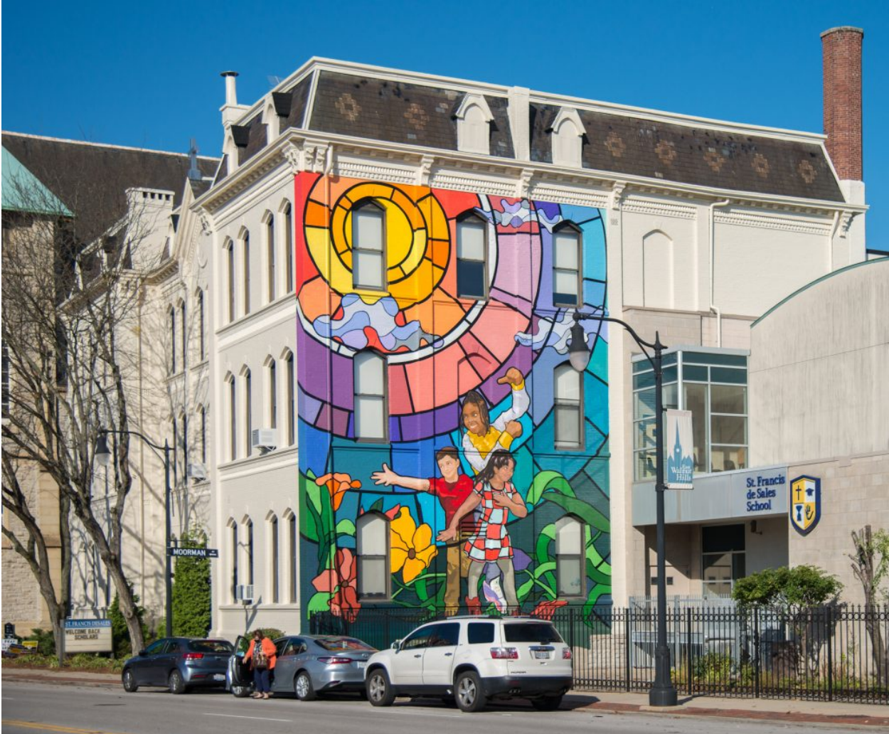
A mural to welcome children as they walk into school ....

Additional examples below only help promote the concept: